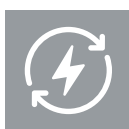
Power Transmission and Distribution