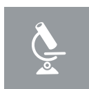
Pharmaceutical and biotechnology