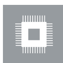
Electronics and communication