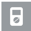
Test and Measurement